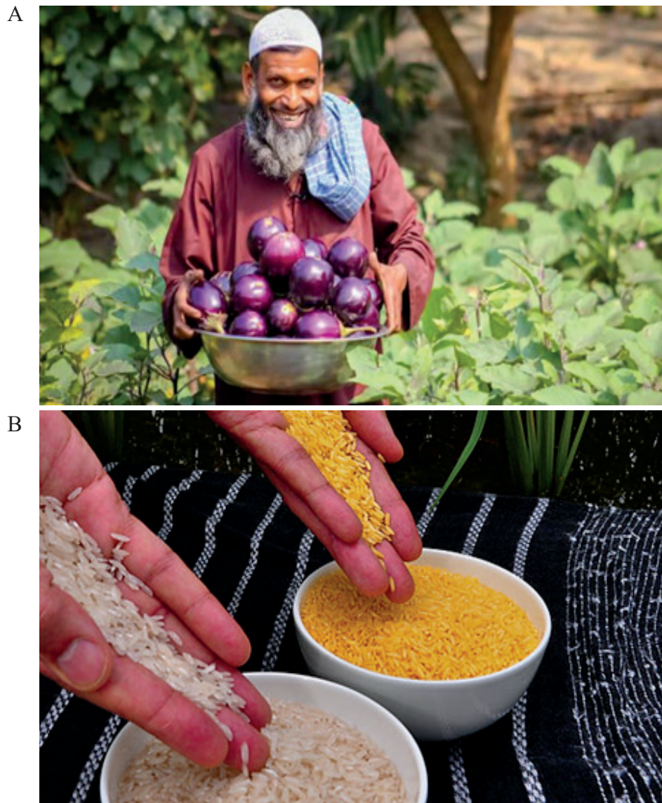
Figure 2. (A) A happy farmer with a harvest of Bt eggplant (B) Golden hue of Golden Rice on the right as compared to non-transgenic rice.

wild potato varieties of three different origins, Mexican ( Solanum bulbocastanum ), Argentinian ( Solanum venturii ), and Peruvian ( Solanum mochiquense ). These GM lines are expected to go for a contained trial later in the year 2021, a single location field trial in 2022, and multi-location trials in two subsequent years before getting the Biosafety approval and will be the second commercially available genetically modified crop in Bangladesh.